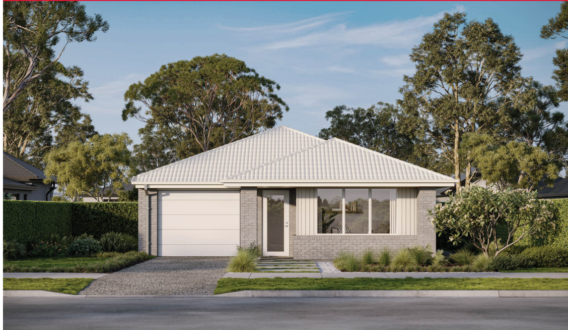
KARRI 13 | EMERGE RANGE