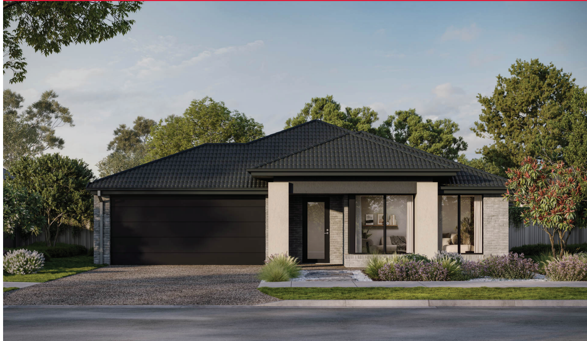
GRANITE 25 | ELEVATE RANGE