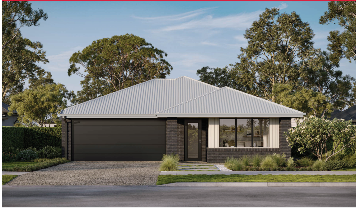
GRANITE 23 | EMERGE RANGE