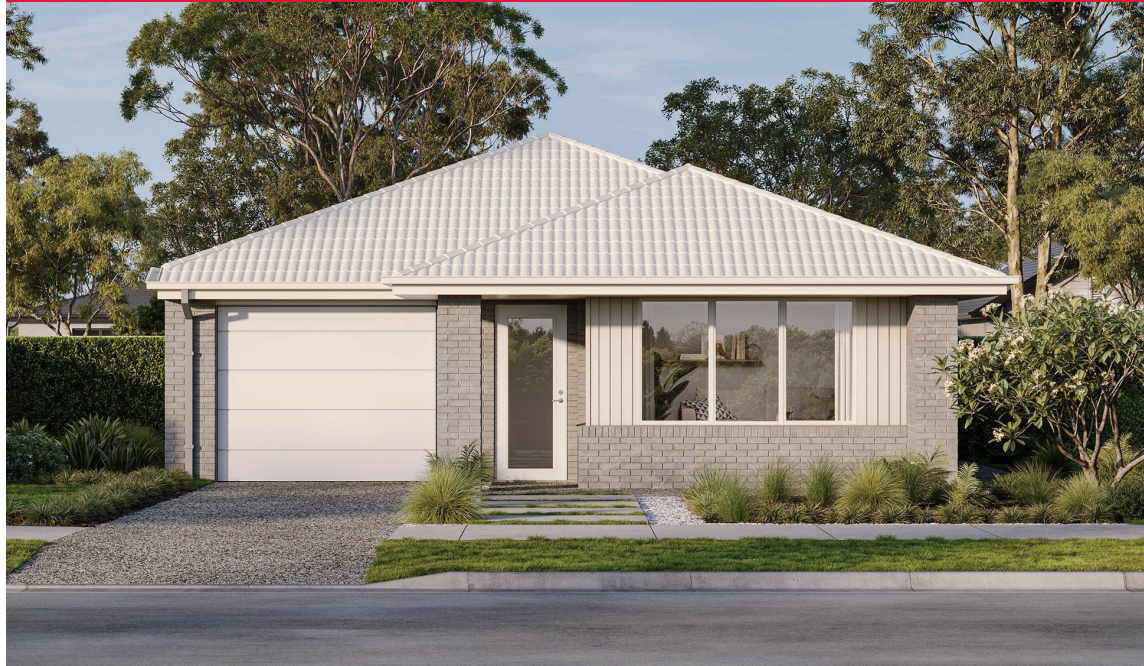
FINCH 18 | EMERGE RANGE